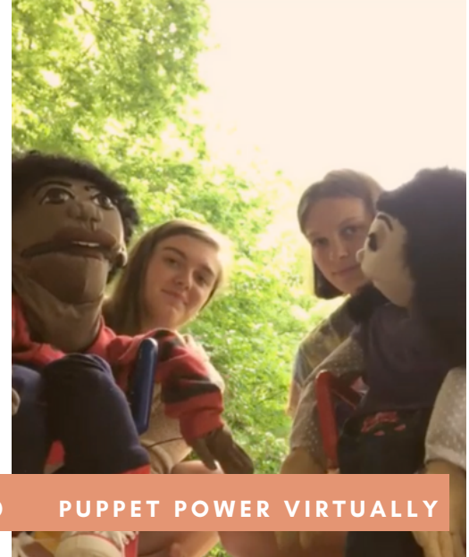
PUPPET POWER VIRTUALLY