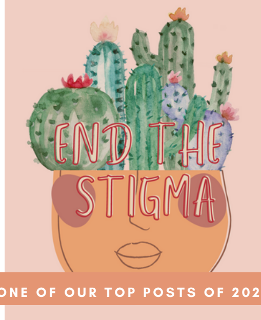
ONE OF OUR TOP POSTS OF 2020