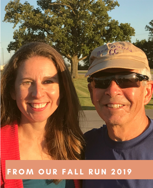
FROM OUR FALL RUN 2019